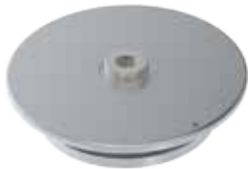
Mobile Adjustment Device for runout testing and adjust- ment of clam (for AXIS series) Part no.: 913 032 010