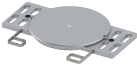
Rotating plate left / right Capacity 6 to. Part no.: 913 011 050