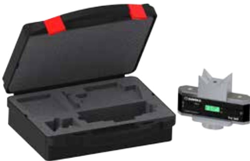
Inclinometer for electronic Wheel Alignment Systems Part no.: 913 009 024