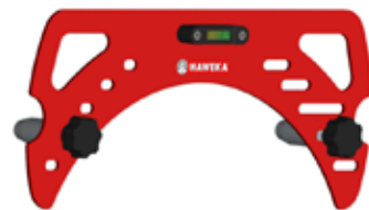
Steering wheel adjustment level mechanically Part no.: 921 001 000