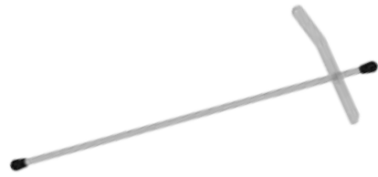
Brake pedal lock Part no.: HWKWA15S