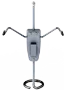
Steering wheel lock Part no.: HWK28751