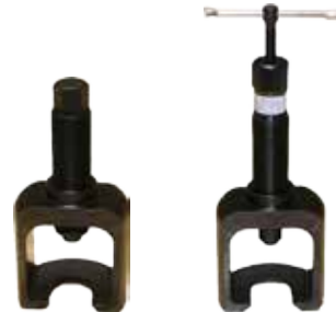
Mechanical / Hydraulic extractor tool for toe and push rods Part no.: 913 000 072 / 913 000 073